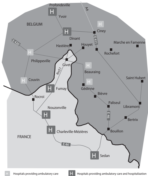
Figure 2: Distribution of hospitals in the Ardennes border region

Reproductive care is one of the most common reasons why people cross borders for health care (Hudson et al., 2011). The Ardennes cross-border collaboration is an established arrangement at the French–Belgian border which allows French patients to cross the border, in particular for obstetrical care, and to give birth in a Belgian hospital, as it is their closest health facility (Figure 2).